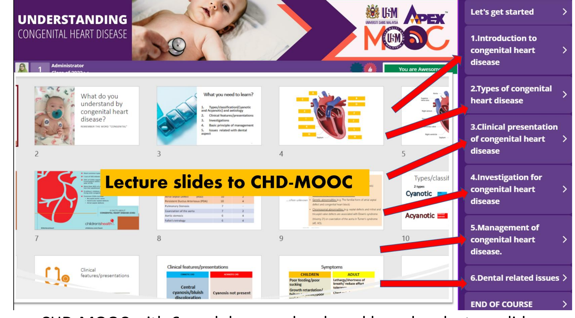
CHD-MOOC with 6 modules was developed based on lecture slides.